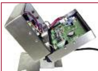
Internal hinge mechanism for ease of service