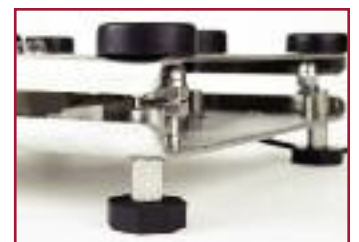
No visible threads assures conformance to Food Safety standards and minimised contamination area