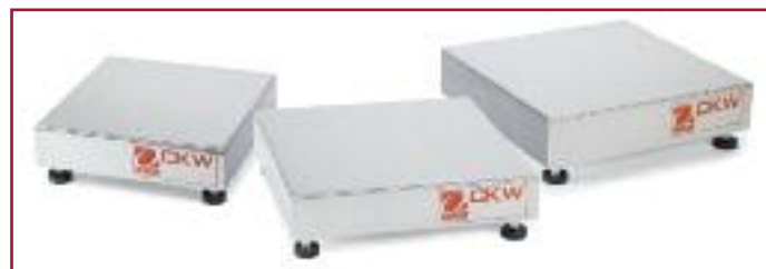
4 x capacity models in 3 base sizes