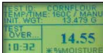
Display shows % moisture, % solids, weight, time, temperature, drying curve and more.