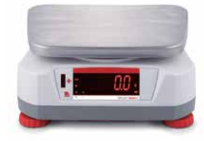
Rear Display with Integrated Touchless Sensor