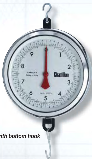
Shown with bottom hook

Certificate of Conformance No. 87-092, Model 0024/A was issued under the national Type Evaluation Program of the National Conference on Weights and Measures, that the design conforms to NIST Handbook 44 Class III. The scale is "Legal for Trade" subject to on-site verification by the local Weights and Measures jurisdictions.