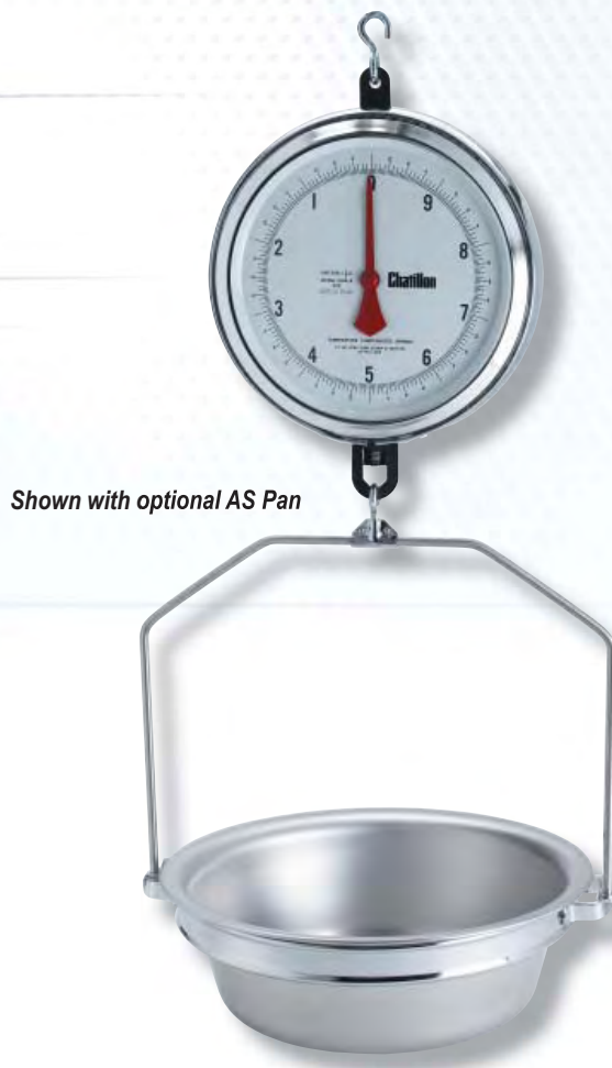
Shown with optional AS Pan