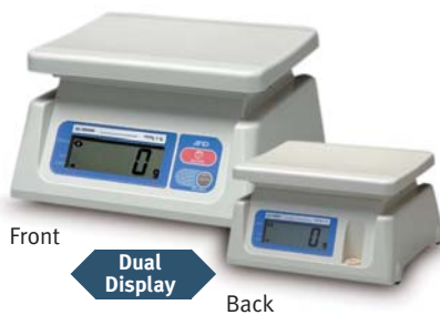
Front Dual Display Back