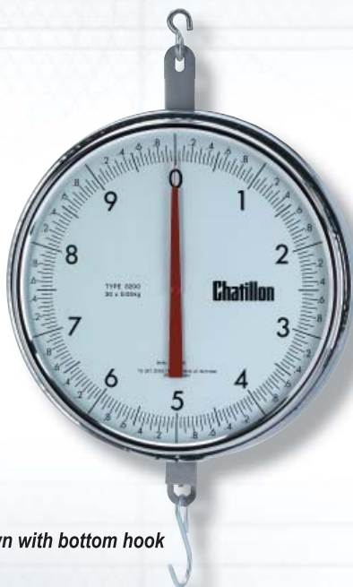
Shown with bottom hook