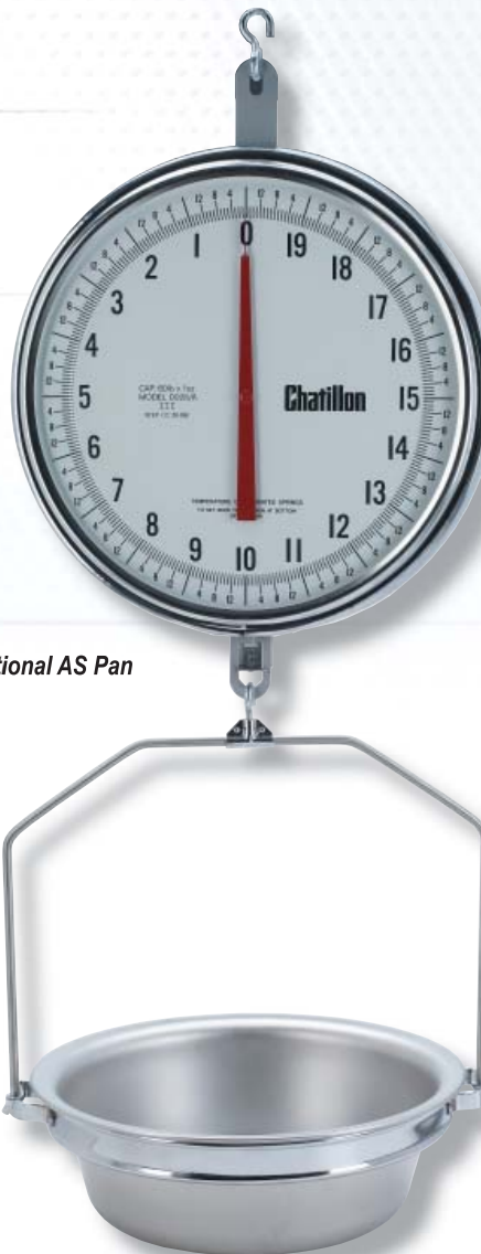
Shown with optional AS Pan

Certificate of Conformance No. 88-060, Model 0028/A was issued under the national Type Evaluation Program of the National Conference on Weights and Measures, that the design conforms to NIST Handbook 44 Class III. The scale is "Legal for Trade" subject to on-site verification by the local Weights and Measures jurisdictions.