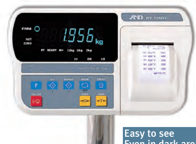
Large VFD Display