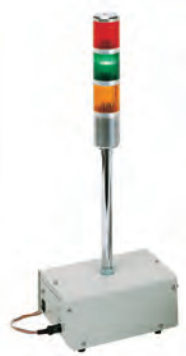
AD-8951 - Light Pole