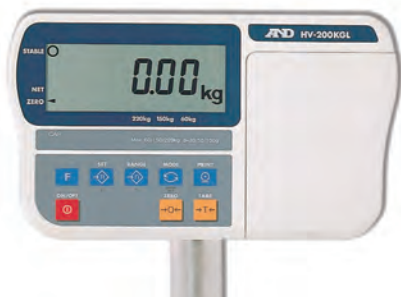
Large LCD Display