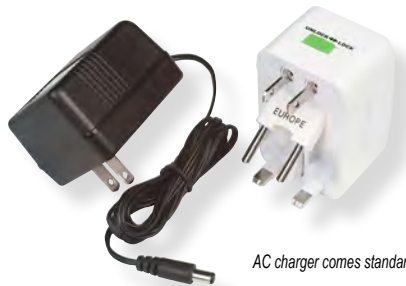
AC charger comes standard with adapter for international plug configurations.

Top Holding Loop Bottom Swivel Hook Remote Controller Battery Charger with Plug Adapter Certificate of Conformance User Guide