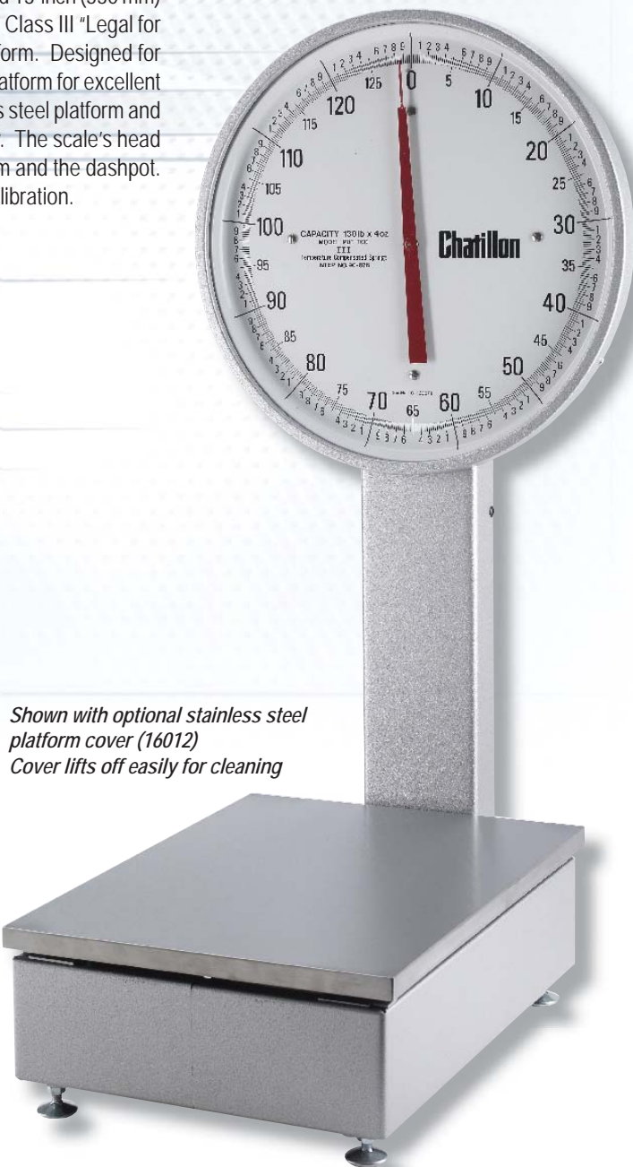
Shown with optional stainless steel platform cover (16012) Cover lifts off easily for cleaning