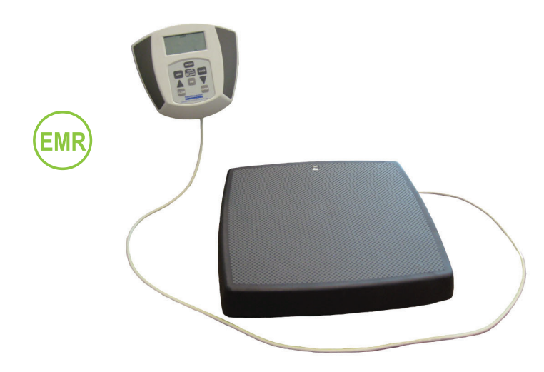
Remote Display can be mounted on a wall or placed on a table