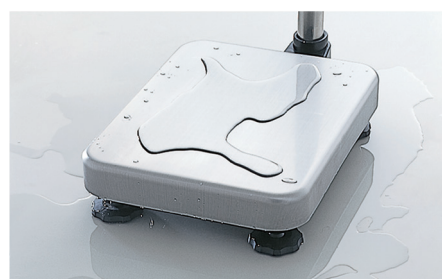
IP65 base unit with a SUS430 pan

The base unit can be washed with water, not to mention that wet objects can be weighed with no problem. Further, the surface of the pan is resistant to chemicals, scratches and rust, and easy to keep clean and hygienic.