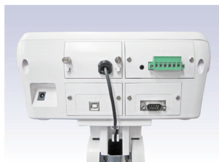
Display unit with HVW-02CB, HVW-03C, and HVW-04C

* 7 For communication with a PC only. The driver software can be downloaded for free.