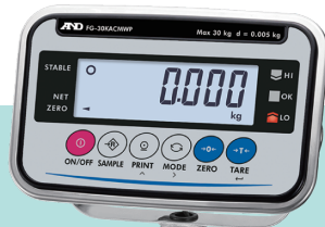
M-size platform (30 kg)