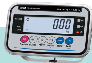
L-size platform (60 kg / 150 kg)